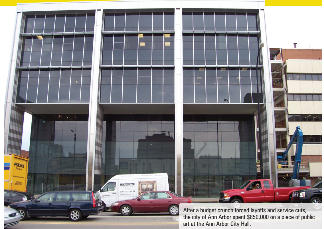
After a budget crunch forced layoffs and service cuts, the city of Ann Arbor spent $850,000 on a piece of public art at the Ann Arbor City Hall.