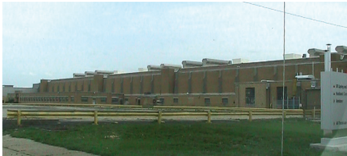
The Hangar42 facility was the subject of a suspicious land deal that led to felony charges.