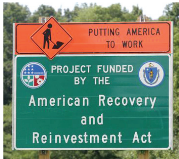
A bill to spend American Recovery and Reinvestment Act money received bipartisan support in the Michigan Legislature.

Republicans in the Michigan Legislature were more supportive of spending this latest chunk of the stimulus pie than their federal counterparts were toward